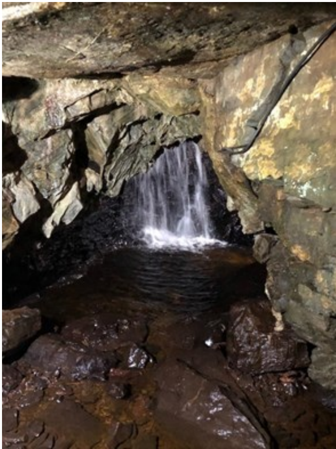
pupils explored the caves, ending up in the cavern.

Year 8 pupils then went on to visit either Swinden or Threshfield Quarry to learn how limestone provides economic benefits. At Swinden, pupils visited this working quarry to understand how rocks are extracted. At Threshfield, pupils learnt about how quarries can be restored and returned to a more natural environment.