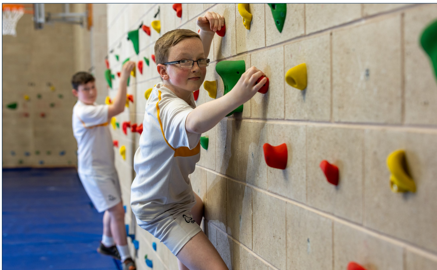
Pictured: Pupils testing out our new bouldering facilities in the Sport Hall, May 2022