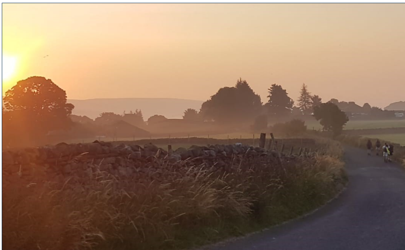
Pictured: DofE Gold Team leaving their campsite at 5:30 am, July 2021